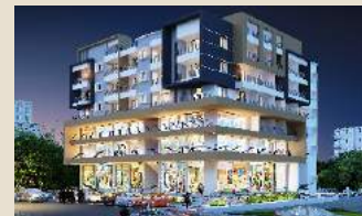
AGRAJA LEGEND NEERMARGA