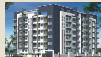
AGRAJA SAROVAR Mulky