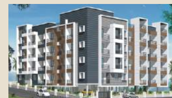
AGRAJA GARDEN Surathkal