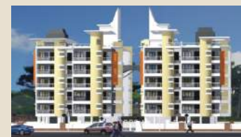
AGRAJA BAPPANADU RESIDENCY Mulky