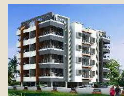
AGRAJA SHILAS Mangalore