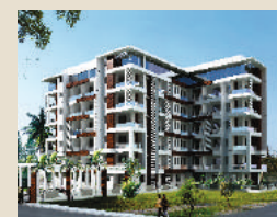
AGRAJA VIVANTA Mangalore