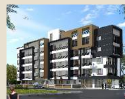
AGRAJA SAMPADA Surathkal